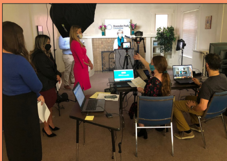
Behind the scenes at RPC's virtual luncheon event on October 6.

Your valuable support of survivors transforms the lives of every person who finds the courage to reach out to us for the help and healing they so truly deserve!